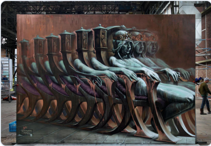
Sokar uno "Generation" Acrylic on Vinyl Canvas 3,5 m x 5 m Street art museum Amsterdam 2017