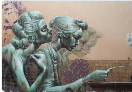
Sokar uno "Hiobsbotschaft" Acrylic on Vinyl Canvas 5 m x 9 m Street art museum Amsterdam 2016