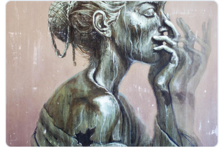
Sokar Uno "Begegnung" Acrylic, Oil on Canvas 100x70cm 2016