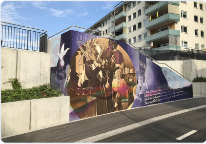
Sokar uno "Nobel" Nobelpreisträgertagung Lindau 2021