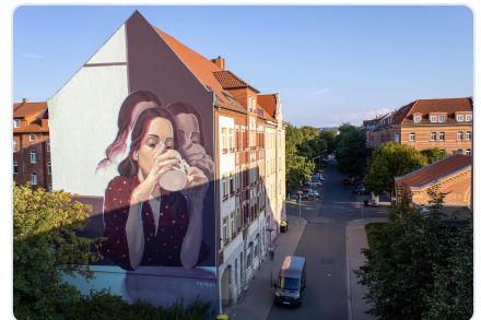
Sokar Uno OQ Paint Freiraumgalerie Erfurt 2019