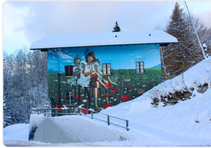
Sokar uno Autra Causa Festival Schweiz 2024