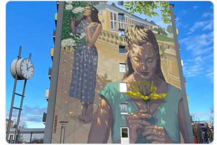
Sokar uno Baugesellschaft Gotha Mural 18x27m Sommertag 2020