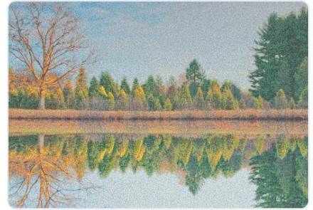
Slady's Pond 1/2" sintered glass tile mosaic 120" x 240" x.25" 2020 $60,000.00