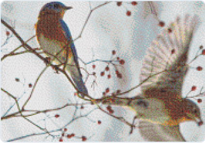
Bluebirds Pair 3/8" vitreous glass tile 80" x 80" x.25" 2010 $10,000.00