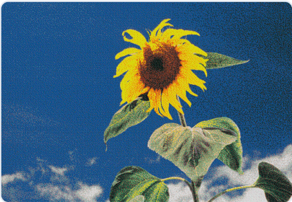
Sunflower 5 3/8" vitreous glass tile 160" x 240" x.25" 2015 $60,000.00