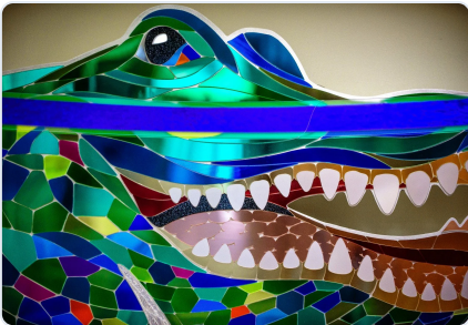
UF Rec Center Weight Room Expansion