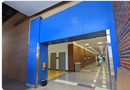
UF Rec Center Weight Room Expansion image of the area