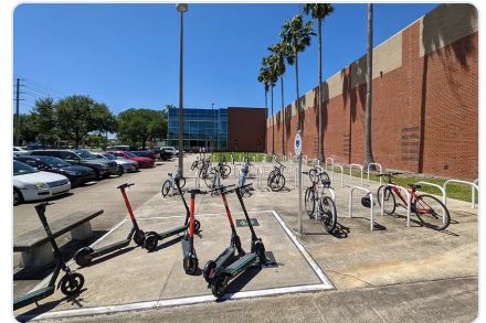
UF Rec Center Weight Room Expansion image of the area